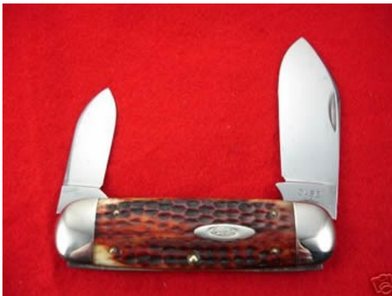
REAL RED BONE ELEPHANT TOE-NAIL HANDLES